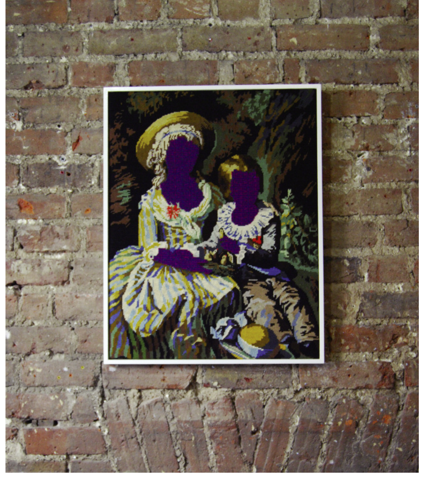
Opposite from far left: Secret Love Reworked textile with beads 49 x 37 x 3cm